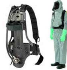
H2S gas escape sets

Please note that this is small collection of the products. We can supply various other items which do not feature in this list. If you are looking for a specific item & not found on this list, please contact us with your requirement at enquiry@hdheights.com