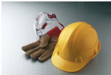
Worker Safety Solutions