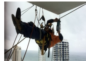
Difficult Access Rescue