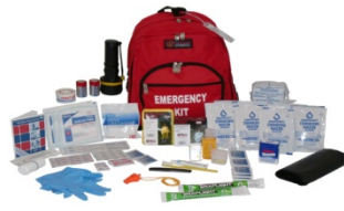
Emergency Survival Packs