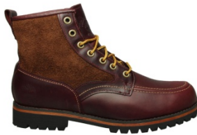
Rubber Work Boots