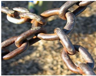
Chain Handling Equipment