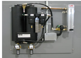
Nitrogen Gas Purging