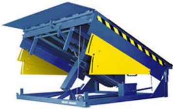
Loading Dock Equipment