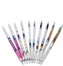
Gas Detector Tube