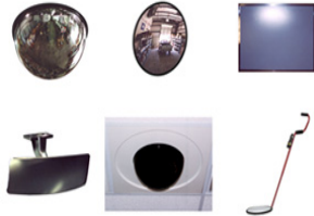
Safety & Security Mirrors